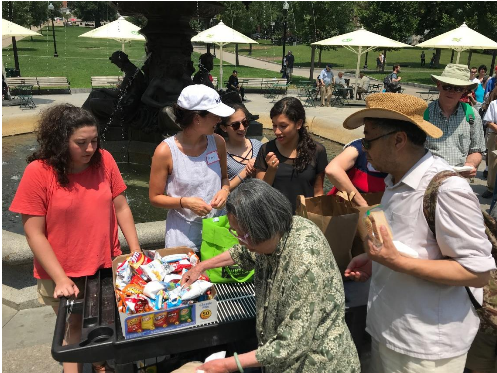
United Parish members serving lunch before worship at Common Cathedral.