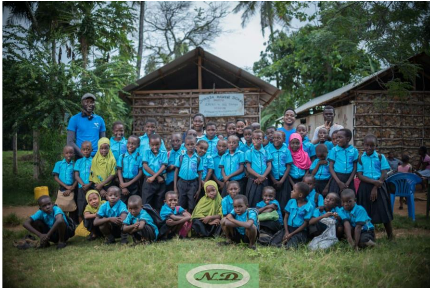
Dhansa Maweni School, Kenya

Join us after worship to purchase cards that let your friends and family know that a gift has been made in their honor to a chosen mission.