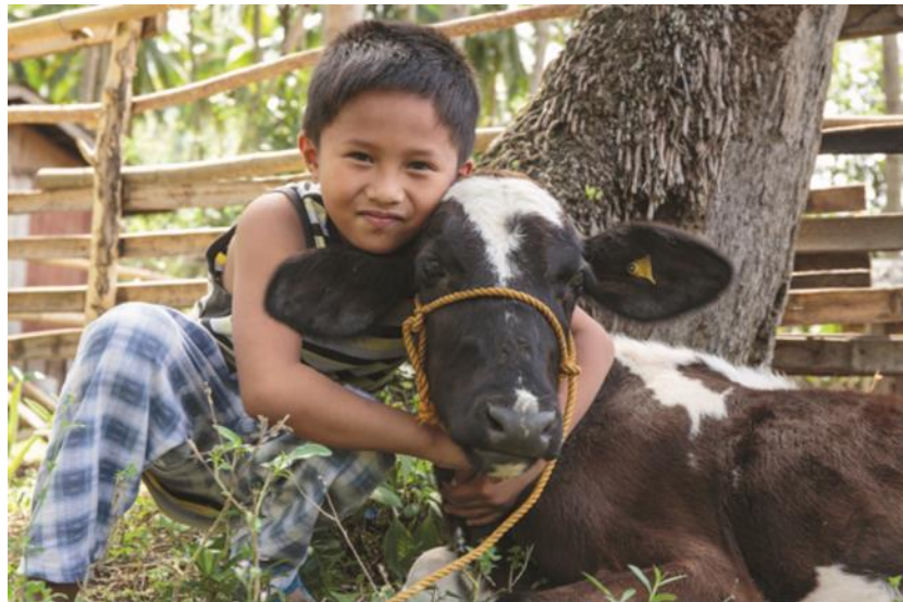
Cows were the first animals that Heifer provided to help people in need to become self sufficient through farming