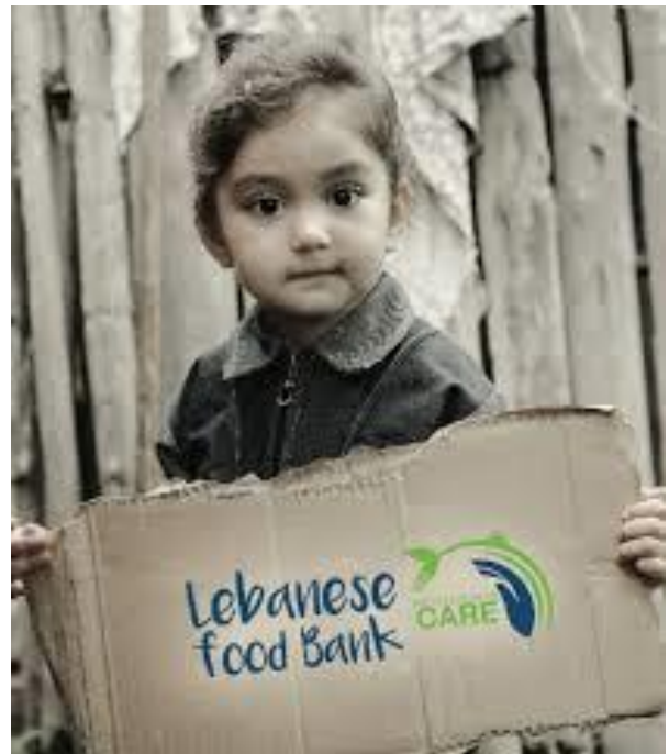
Lebanese Food Bank

The United Parish in Brookline Missions Giving Committee will match donations.