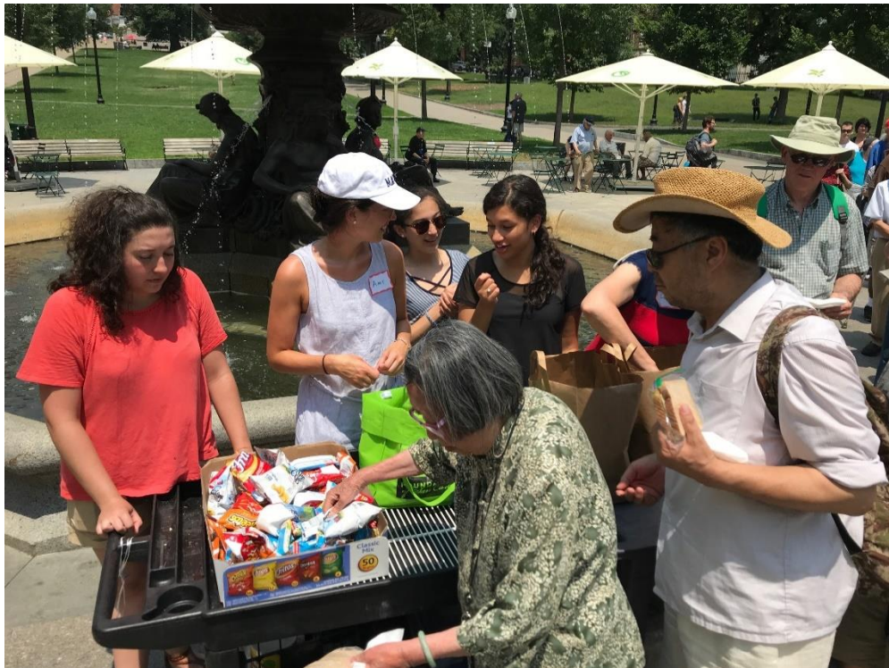
United Parish members serving lunch at Common Cathedral (photo, pre-COVID)