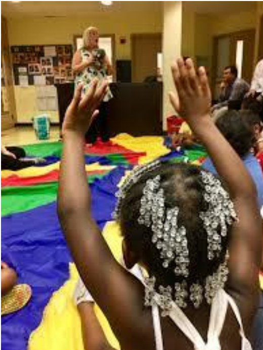
Horizons for Homeless Children

Even during COVID-19? Especially during COVID-19