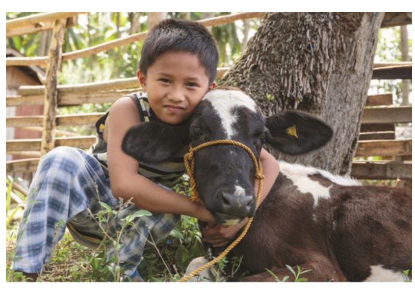
Cows were the first animals that Heifer provided to help people in need to become self sufficient through farming