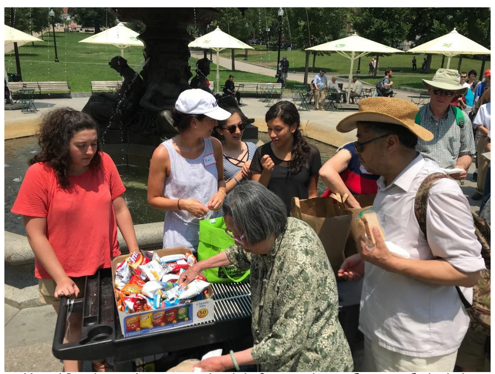
United Parish members serving lunch before worship at Common Cathedral.