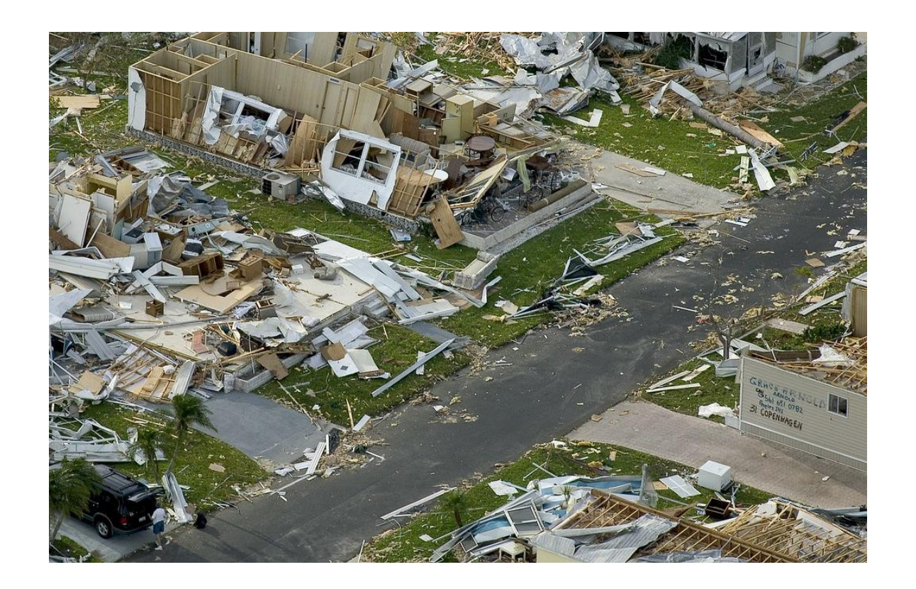
Gift #4: Disaster Relief