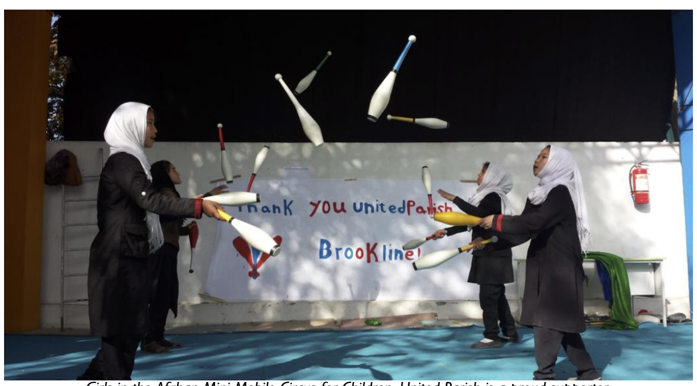
Gift #13: United Parish Mission Giving Committee

Girls in the Afghan Mini Mobile Circus for Children. United Parish is a proud supporter.