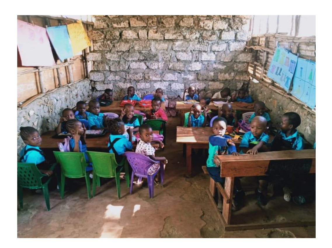
Gift #4: Dhansa Maweni School, Kenya