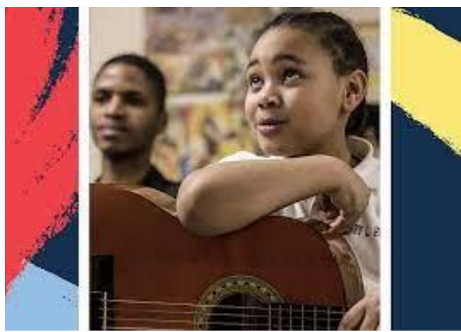
Hamilton-Garrett Music and Arts Academy