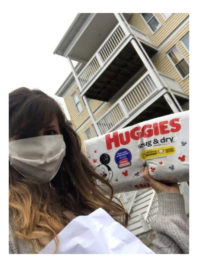
Gift #7: Kataluma for Afghan Refugees in Brookline

Families from Afghanistan have arrived in Brookline and need support.