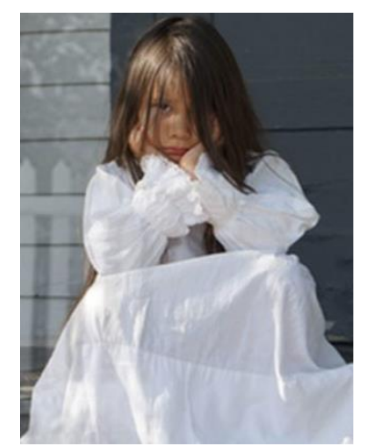
Native American Boarding School Healing Coalition