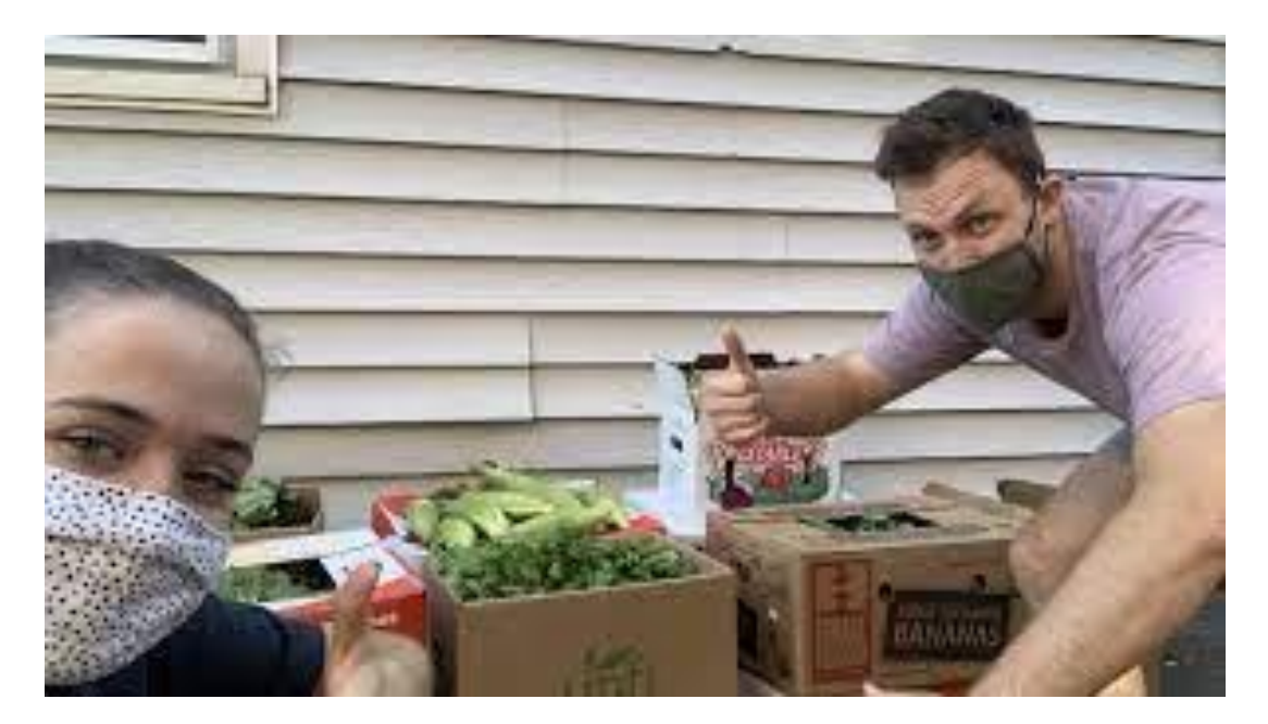
Gift #2: Brookline Food Pantry

Give this Christmas. Visit brooklinefoodpantry.org to learn how you can volunteer throughout the year.