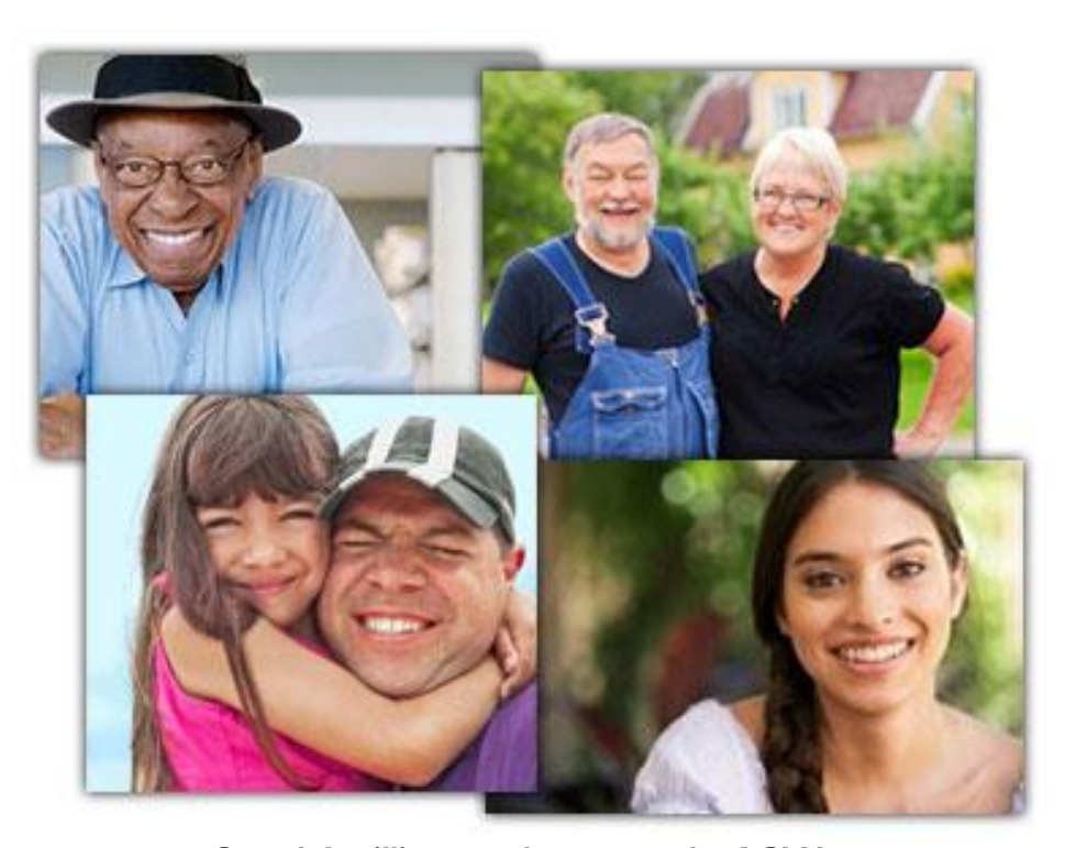
Over 1.6 million people support the ACLU.