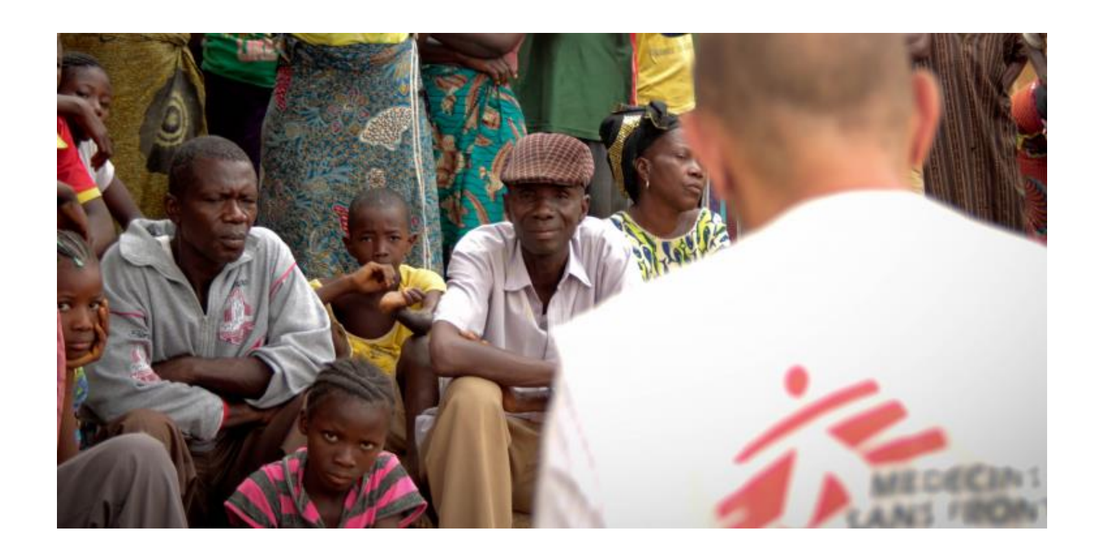
Gift #8 - $10 to help provide meals to refugees

Doctors Without Borders observes neutrality and impartiality in the name of universal medical ethics and the right to humanitarian assistance and claims full and unhindered freedom in the exercise of its functions.