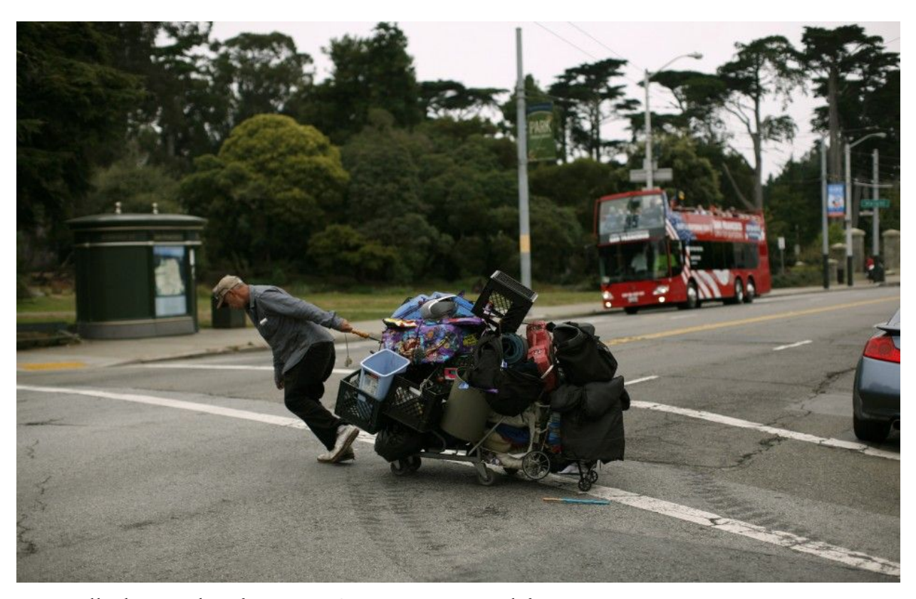
Man pulls the weight of poverty, San Francisco, California, 2015.