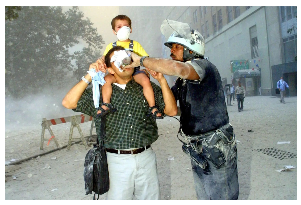
A police officer helps evacuate people from the area around the World Trade Center, September 11, 2001.