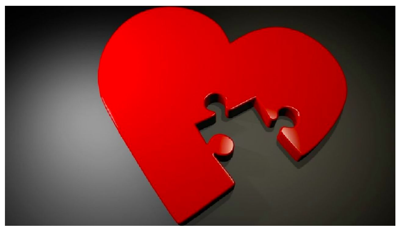
From WTXL-Tallahassee, (Source: Pixabay)

Celebrating United Parish's 50th Anniversary