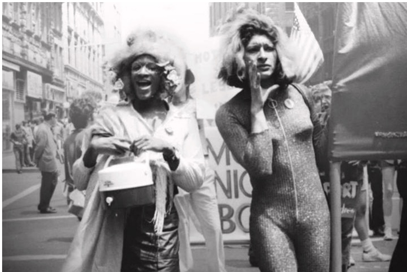
Marsha P. Johnson (left) and Sylvia Rivera march in New York City in 1973.