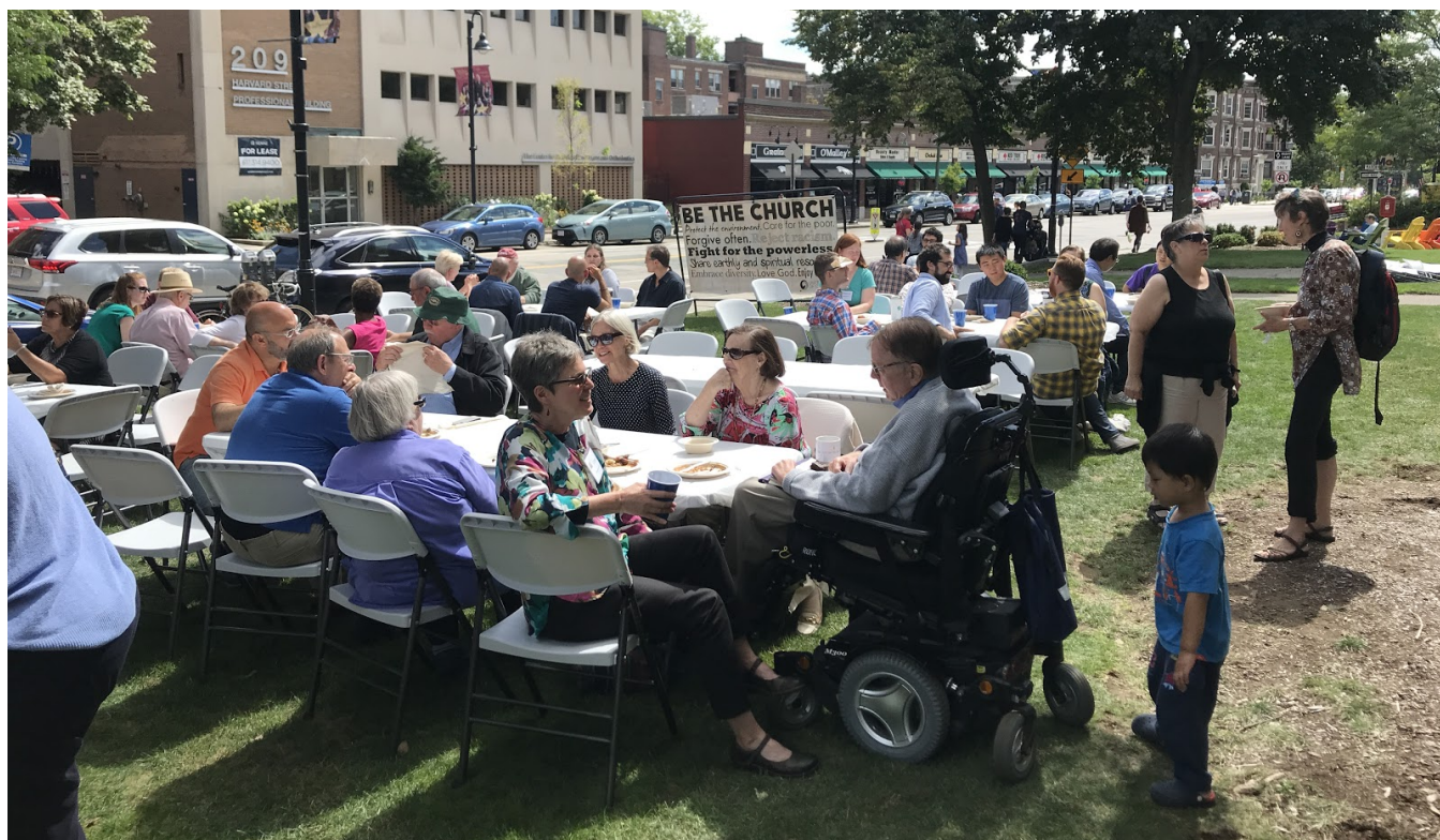
United Parish's Welcome Back Potluck on the front lawn. September 8, 2019.