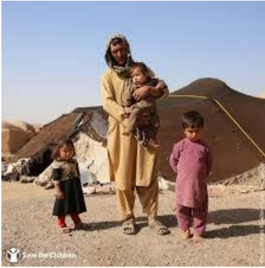
Save the Children