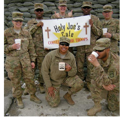
Holy Joe's Café

The Missions Giving Committee will MATCH donations to these organizations.