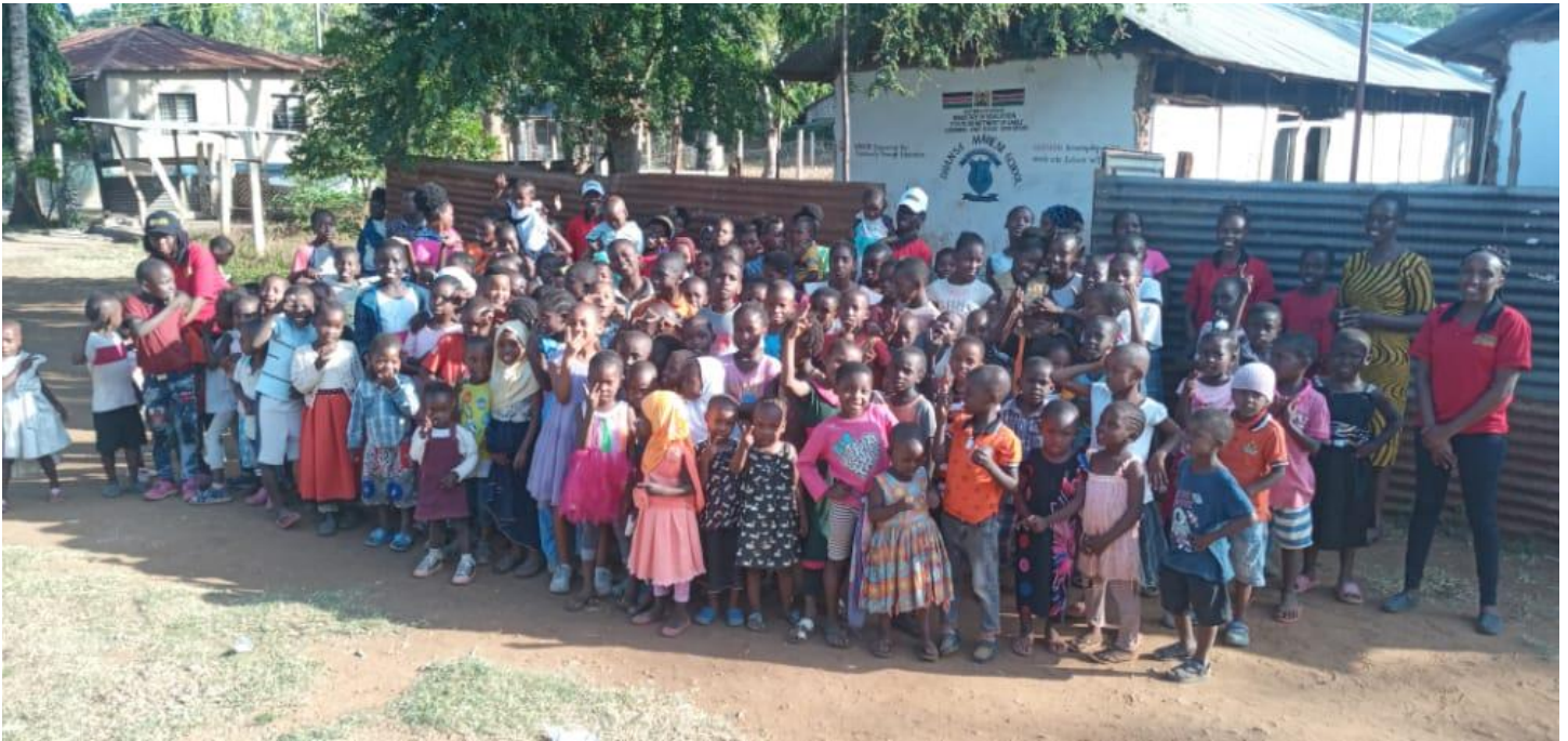
Gift #3: Dhansa Maweni School, Kenya