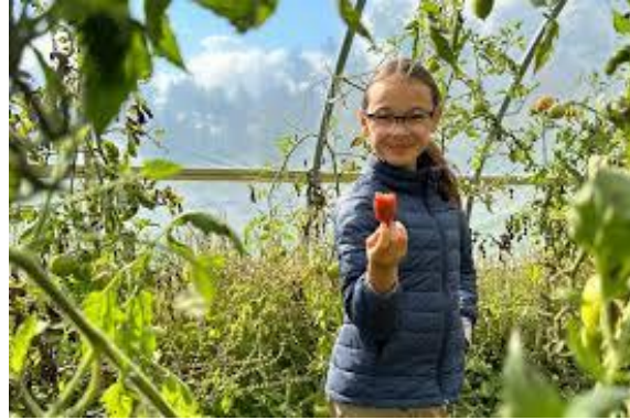
The Farm School