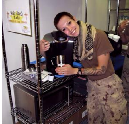
Multi Medical Unit in Afghanistan