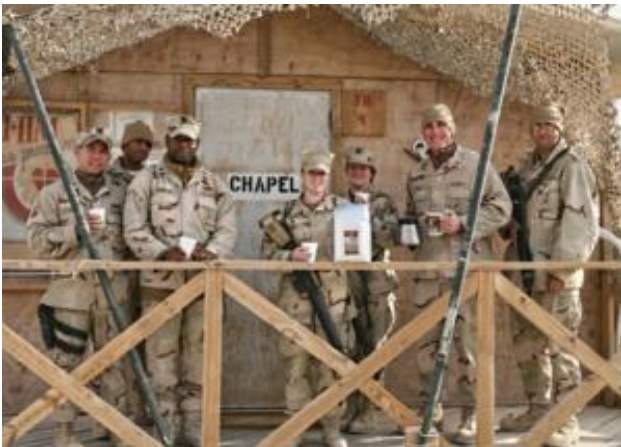
Construction Battalion in Iraq

All service personnel are welcome, including NATO troops from other countries that share the same base as well as people of all religious faiths and backgrounds. US denominational chaplains want to promote a place for relaxation, focusing on great coffee and conversation. It is vital for troops to have a place to unwind and share a taste of home.