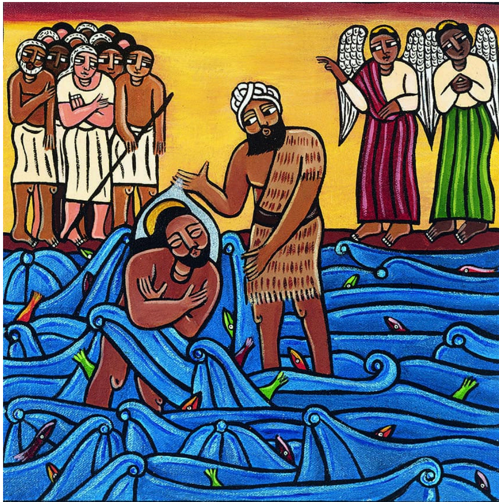
"Jesus' Baptism" by Laura James

American Baptist • United Church of Christ • United Methodist