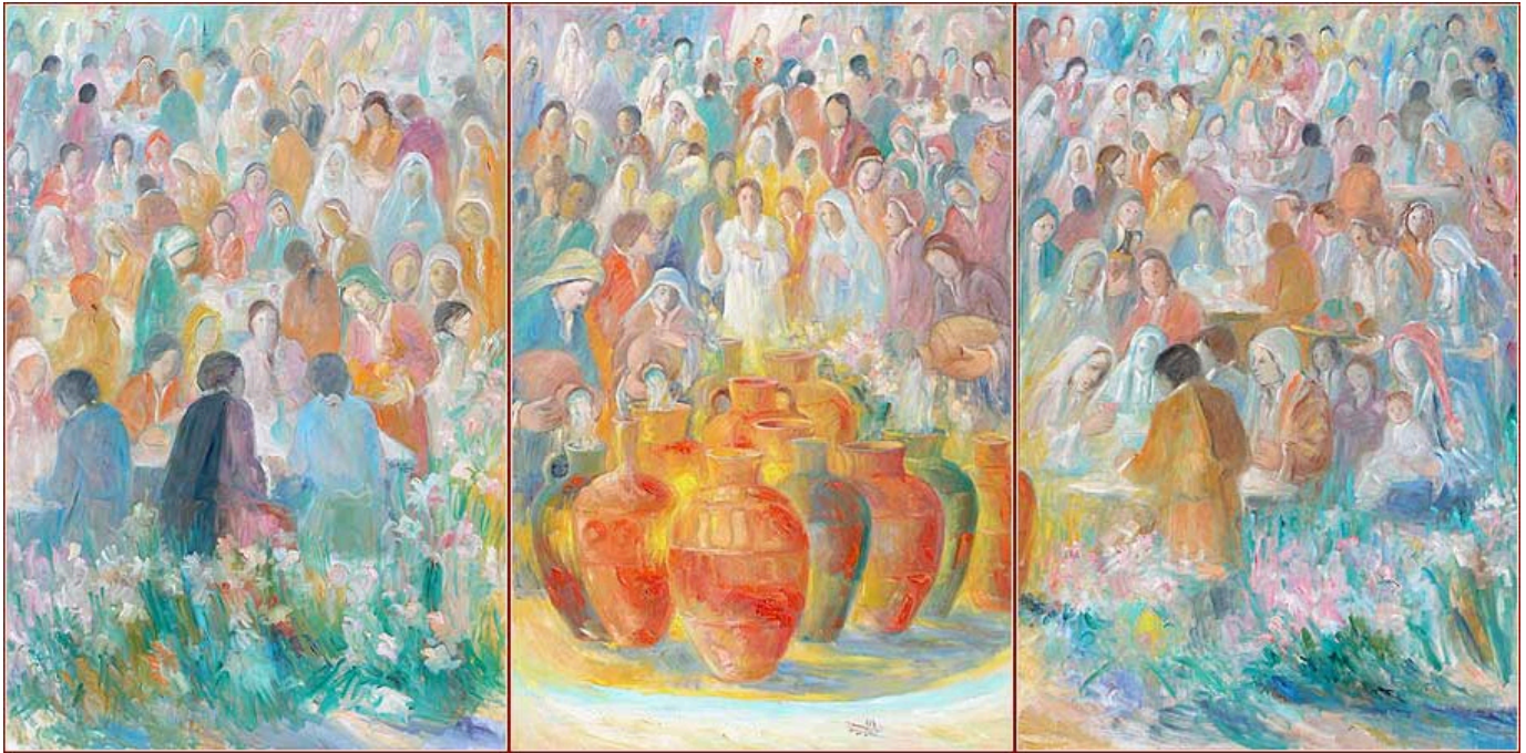
"The Tenth Triad (The Wedding at Cana)" by Joseph Matar from LebanonArt.com.

American Baptist • United Church of Christ • United Methodist